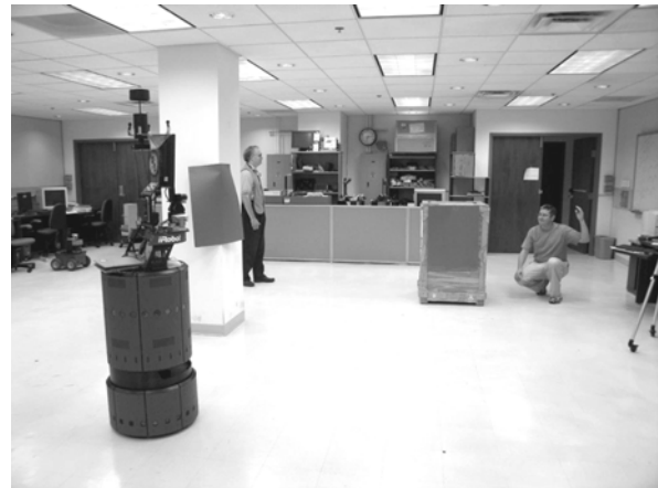
Figure 1. Robot, Target (standing), Team Member (crouching), and Objects in the Laboratory Environment

In the research presented in this paper, we introduce a reconnaissance task that requires a robot and a human to work together to covertly track and approach a moving target (a human or robot). See Figure 1.